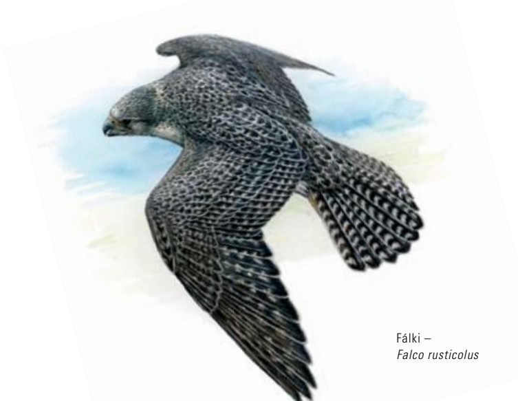
Fálki – Falco rusticolus